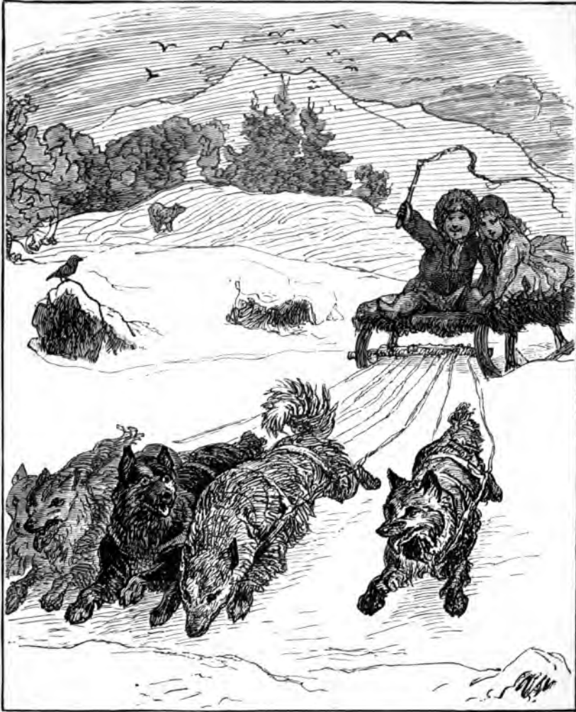
Whisking over the snow with all her might and main, muffled up in cloaks and furs.